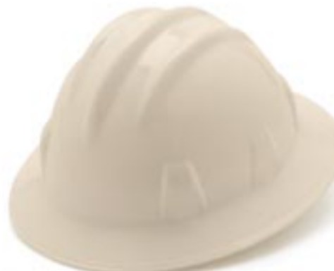
718FBW White Cap Style / 4 Point Snap Lock Suspension 718FBY Yellow Cap Style / 4 Point Snap Lock Suspension 718FBB Blue Cap Style / 4 Point Snap Lock Suspension

When ordering add the letter "R" after the number