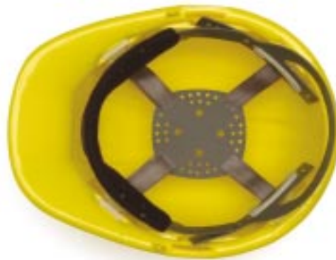
Cap Style 4 Point Snap Lock Suspension