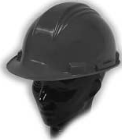
A69 6 point nylon web suspension with pin lock adjustment ▼