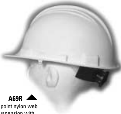
A69R ▲ 6 point nylon web suspension with ratchet