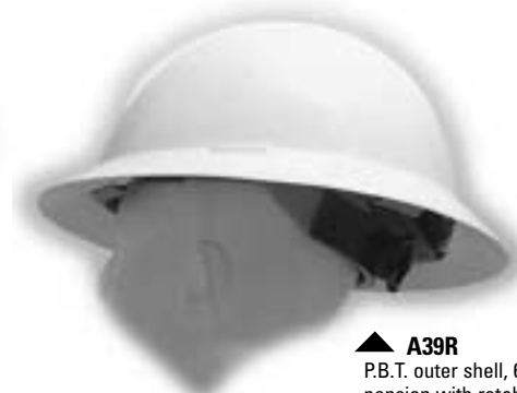
A39R P.B.T. outer shell, 6 point web suspension with ratchet.

All the above safety protective caps meet and exceed ANSI Z.89.1.1986 standards