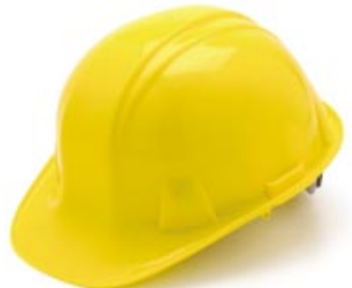
718G Green Cap Style / 4 Point Snap Lock Suspension 718OR Orange Cap Style / 4 Point Snap Lock Suspension 718R Red Cap Style / 4 Point Snap Lock Suspension