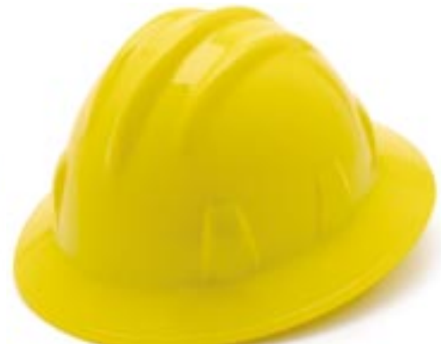
718FBG Green Cap Style / 4 Point Snap Lock Suspension 718FBOR Orange Cap Style / 4 Point Snap Lock Suspension 718FBR Red Cap Style / 4 Point Snap Lock Suspension