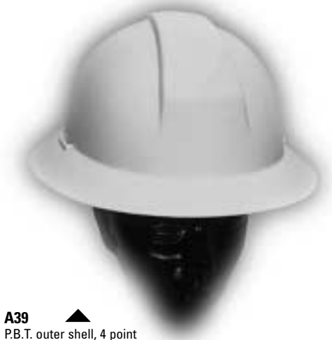
A39 P.B.T. outer shell, 4 point web suspension with pinlock adjustment.