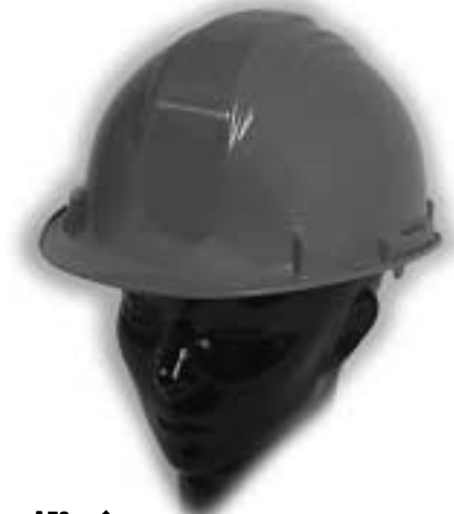
A79 ▲ 4 point nylon web suspension with pin lock adjustments