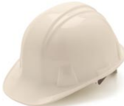
718W White Cap Style / 4 Point Snap Lock Suspension 718Y Yellow Cap Style / 4 Point Snap Lock Suspension 718B Blue Cap Style / 4 Point Snap Lock Suspension