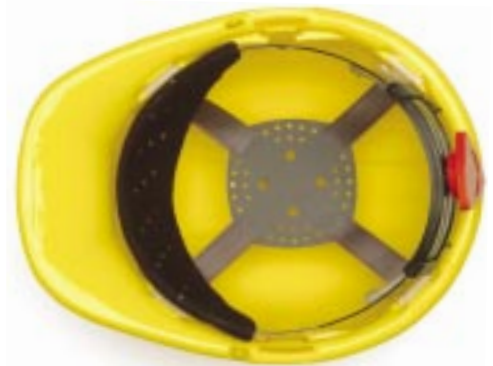
Cap Style 4 Point Ratchet Suspension