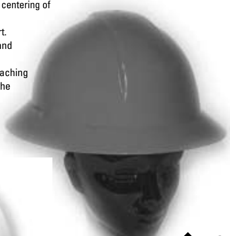
A49 High density polyethylene outer shell, 4 point web suspension with pinlock adjustment.