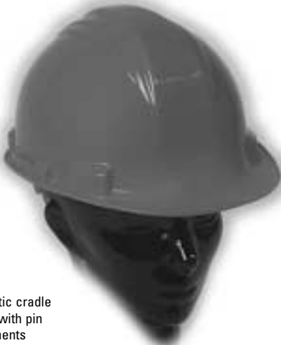
A59/6 ▶ 6 point, plastic cradle suspension with pin lock adjustments