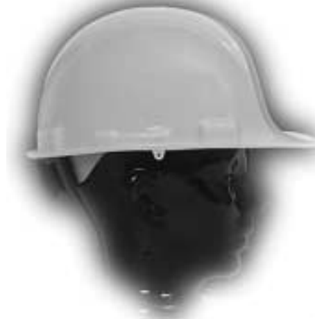
▲ A79R 4 point nylon web suspension with ratchet