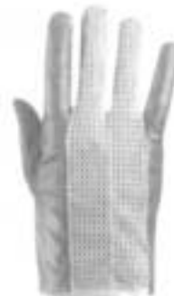
32-105 HYNIT™ Ultra-Cool Perforated Mesh Back