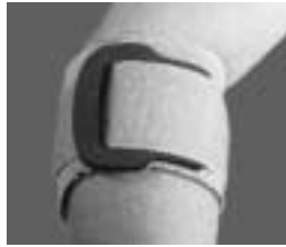
Tennis Elbow w/Pad 8*205