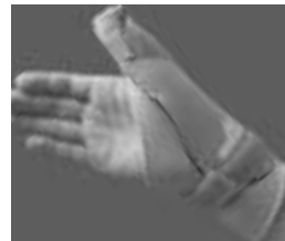
Thumb Spica L 8*257 R 8*258