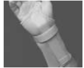
Carpal Tunnel Brace L 8*242 R 8*243