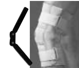
Hinged Knee Dual Pivot 8*274