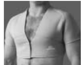
Double Shoulder 8*220