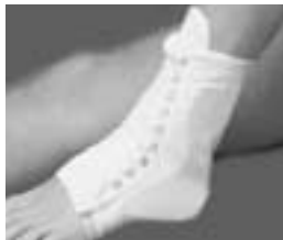
Ankle Brace 8*245