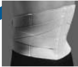
Lumbar Support 8*227

▲ Hand or machine wash in warm water using mild