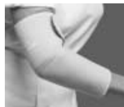
Arthritic Elbow 8*306