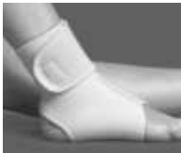
Arthritic Ankle Wrap 8*305