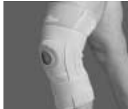
Knee Stabilizer 8*246