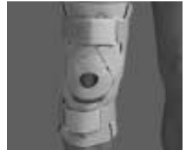
Knee Derotation Stabilizer 8*247