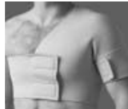
Single Shoulder L 8*218 R 8*219