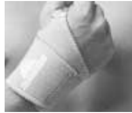
Universal Wrist Wrap 8*226