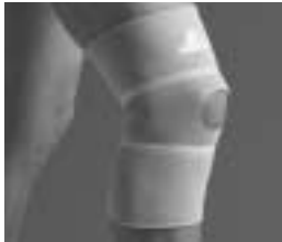
Knee Patella 8*209