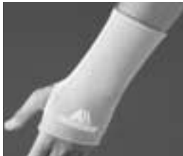
Standard Wrist/Hand L 8*214 R 8*215