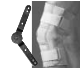
Hinged Knee Range of Motion 8*275