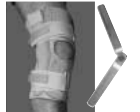
Hinged Knee Wrap Single Pivot 8*276