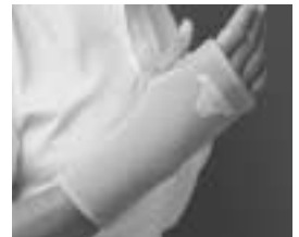
Arthritic Wrist/Hand L 8*303 R 8*304