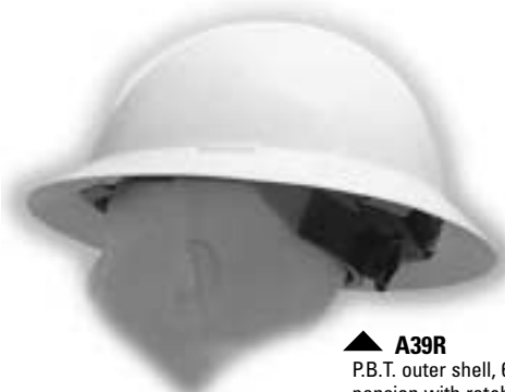
A39R P.B.T. outer shell, 6 point web suspension with ratchet.

All the above safety protective caps meet and exceed ANSI Z.89.1.1986 standards