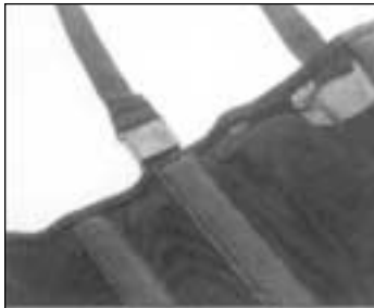
Elastic cinch straps, firm support