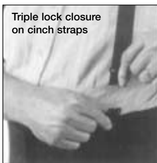
Triple lock closure on cinch straps